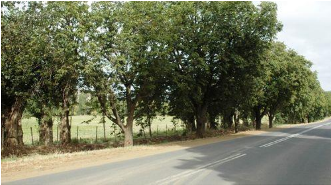
Bushy Park – Memorial Avenue