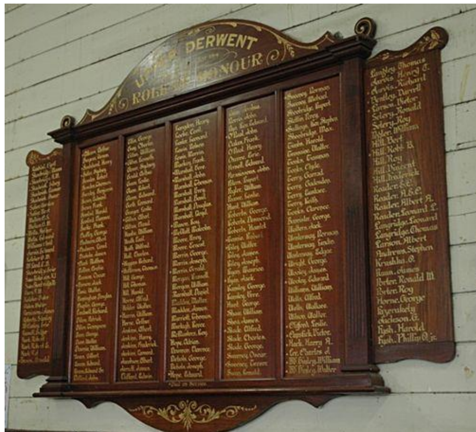
Upper Derwent Roll of Honour – Bushy Park Hall

Pte Edney Shadwick was also remembered on the Upper Derwent Roll of Honour located at Bushy Park Hall, Gordon River Road, Bushy Park, Tasmania.